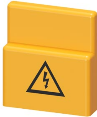
Accessory for SIRIUS 3RM1 Cover cap for busbars